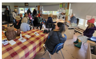
Just a few of the many attendees!