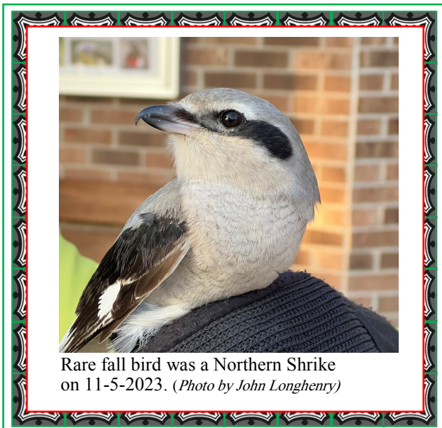
Rare fall bird was a Northern Shrike on 11-5-2023.