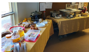
The breakfast buffet was provided by SBBO volunteers.